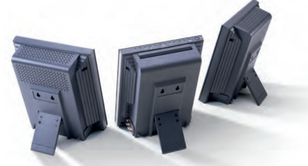
Easel-styled supports allow SoundSpace 5 to be angled when free standing. Keyholes are provided on each unit for wall-mounting