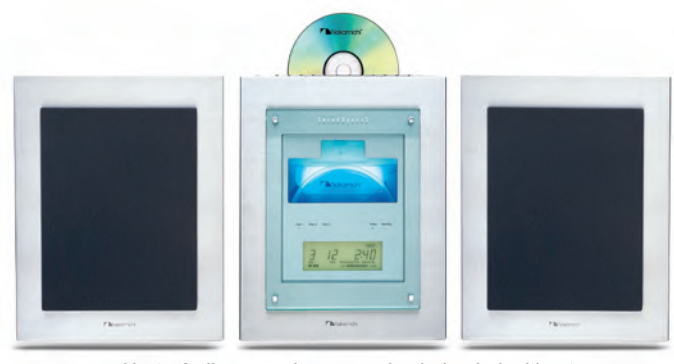
Up to 3 discs can be conveniently loaded without the use of trays or magazines.

The inventive minds of Nakamichi have combined their legendary abilities in stereophonic reproduction with sensitivity to your need for "getaway" personal space. The result is SoundSpace 5, a stereo music system designed for personal stereo satisfaction in places where full-sized audio components are not appropriate.